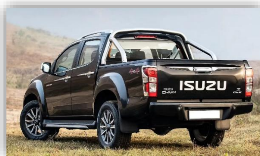
Image only for Vehicle representation, features may vary.